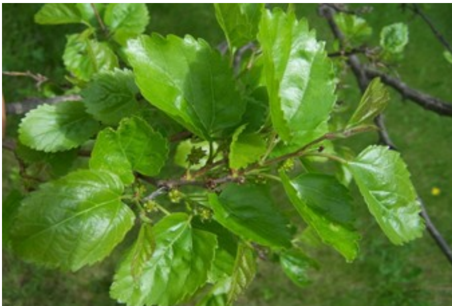
Figure 1 — Morus alba leaves.