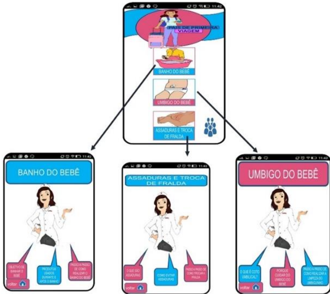
Figure 3 - "First-time