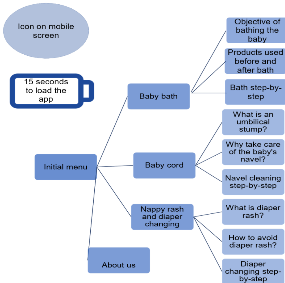
Figure 2 - "First-time parents" ( Pais de Primeira Viagem ) navigation flowchart

Then came the definition of knowledge that took place from the literature review. Thus, the application navigation flowchart was produced (Figures 2 and 3).