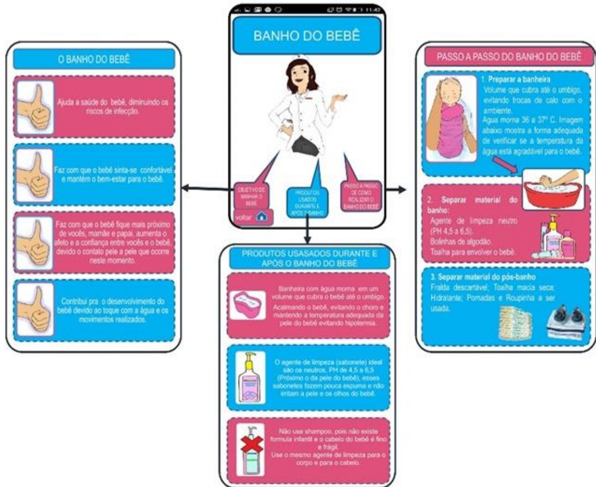
Figure 4 - "First-time parents" screens and layouts

Next, the system was codified using the following programs: Visual Box; Sublime Text; Kiyv Library; Buildozer and Python language. This process resulted in the production of a cross-platform application tested on Windows, Linux, Android and iOS operating systems. Finally, system assessment was carried out and the application was tested on Android operating system devices, which expressed adequacy in its functioning.