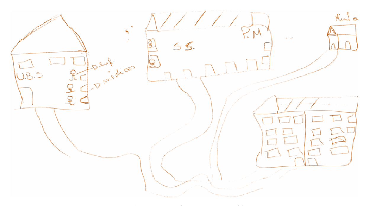
Figure 2 - Speaking-map created by E2.

[...] we would go to the health post, from there they referred us to the health secretary, then to the hospital, and then it was the path we took the most, until they referred me to the hospital here, that's about how it happens [...]. (SPEAKING-MAP, I2)