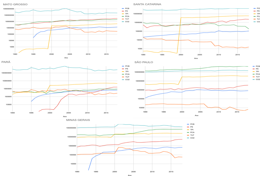
Figure 3 - Time series of CO 2 emissions

northern and central western states, which are part of the Amazon rainforest and Cerrado. Comparing the variables by state (Figure 3), it is observed that the state of Mato Grosso is the largest emitter of CO 2 , where the variable land use change follows the values of CO 2 emission. The graph is in logarithmic scale, it can be seen that in the period from 1990 to 2004 there was an increase in all variables, and from 2004 to 2010 there was a reduction in both CO 2 emissions and total land use change. However, it is noted that other variables did not have the same behavior in Mato Grosso, for example, the agricultural production variables, even with a reduction in CO 2 emissions continue to rise.