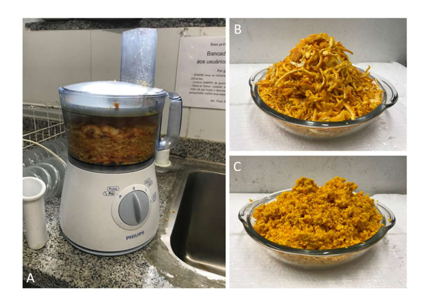
Figure 1 - Crushing the substrate. A) Food multiprocessor; B) Sliced peel; C) Crushed peel.

The tangerine peels were subjected to a crushing process to reduce the size of the material and obtain a homogenized mass (Figure 1). Afterwards, such residues were also properly stored under refrigeration at -4 °C.