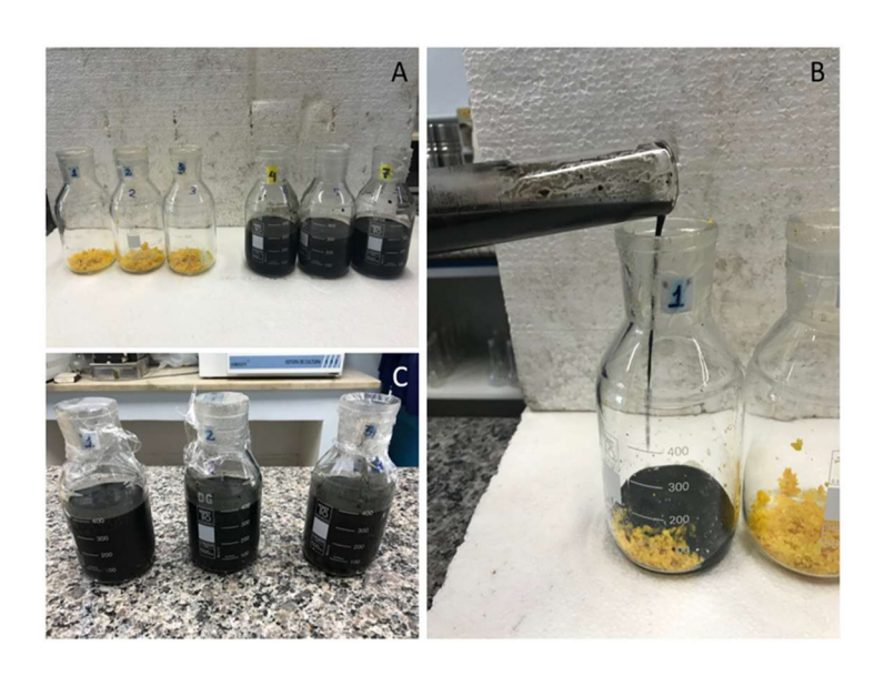
Figure 2 - Preparation of the substrate-sludge mixture for the BMP test

Based on the restrictions and the physicochemical characteristics of the residue, the substrate mass and the amount of anaerobic sludge for digestion were calculated. Thus, for the "ponkan" tangerine, 10 g of substrate was added to 390 mL of sludge, while for the "montenegrin" tangerine, the values were 12 g and 388 mL, respectively. In the bottles containing only anaerobic sludge, the added value was 400 mL for both tests. Figure 2 shows the sample preparation process in the flasks. It should be noted that the tests were performed in triplicates.