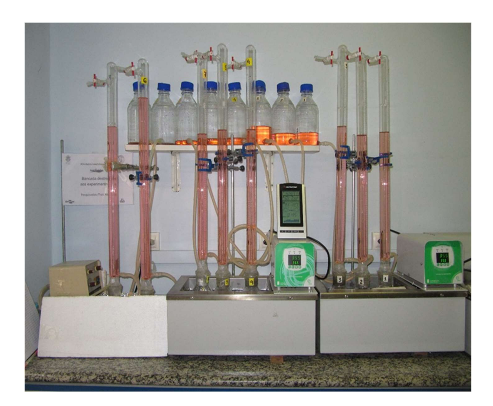
Figure 3 - LGMA equipment used for the BMP test.

Afterwards, the flasks were finally coupled to the eudiometer, starting the test with daily measurements of gas generation and future analyzes on the biogas generator potential of the tangerine peel residues. Figure 3 shows the complete system of the equipment used for the BMP test at the Laboratory of Geotechnics and Environment (LGMA) of PUC-Rio, to analyze the potential of biogas generation through anaerobic digestion of the tangerine peel.