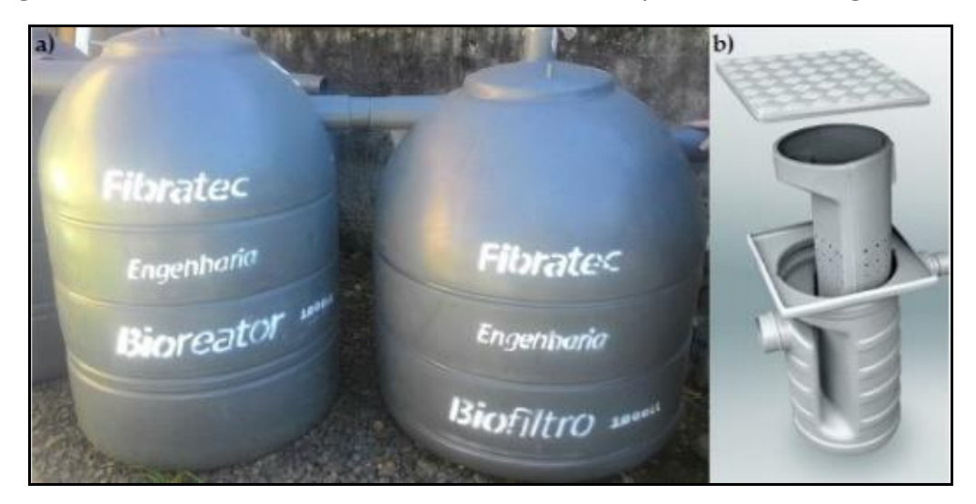
Figure 1 – a) Bioreactor / Biofilter. b) Grease trap. FIBRATEC Engenharia®

On the other hand, the upflow anaerobic biofilter has, as a filter medium, pieces of high-density polyethylene corrugated tubes, which are commonly used in drainage systems or protection of electricity-conducting cables, replacing the conventional filter mediums. The use of this material provides a greater surface area in addition to its advantages in the maintenance of the system, since microorganisms, at the end of their metabolic activity, are not able to maintain fixation in the tubes and end up being carried by the effluent flow, not generating accumulations in the filter medium. Moreover, it is also notable for its smaller weight, which facilitates the transportation of the equipment. Figure 1 shows the equipment used.