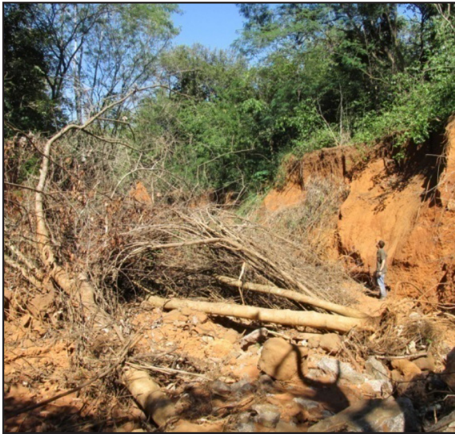
Figure 2 – Suppression of native vegetation