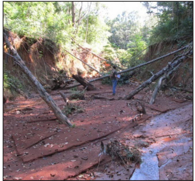
Figure 3 – Gully