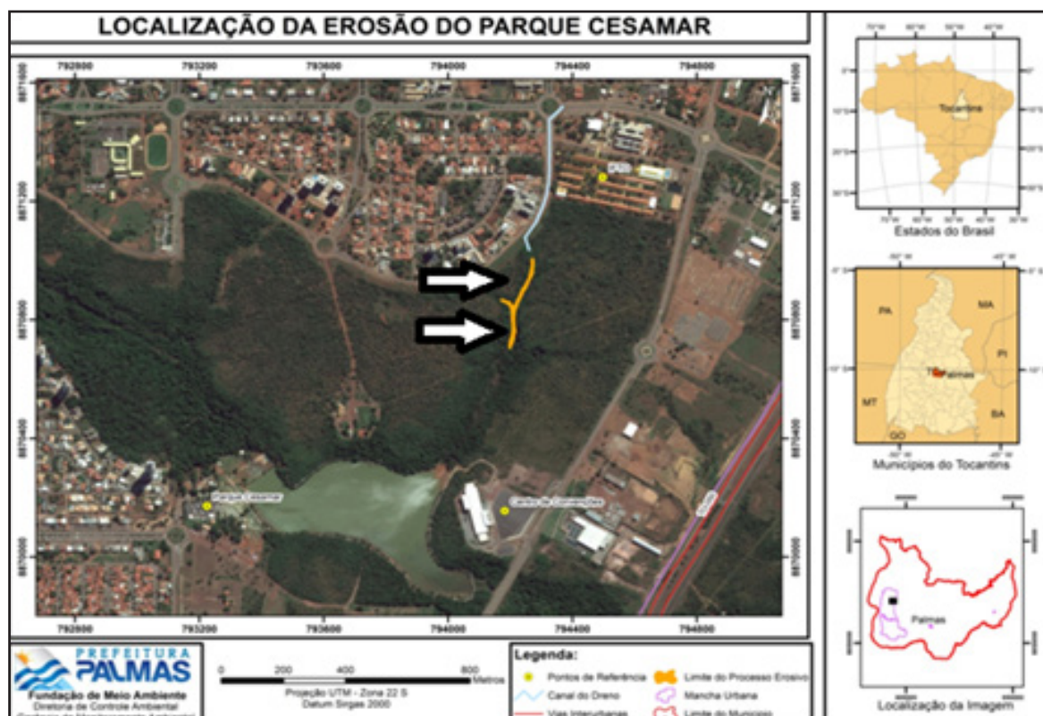
Figure 4 – Localization the erosiv process from the court AVSE 33

It is necessary to soften the slope angulation because they, in most parts, have negative angulation. The lower the angle of inclination of the slope, the greater the possibility of overlapping of them, further aggravating the situation. Slopes of 45 ° to 60 ° are suggested. At every 3 (three) meters of height of the embankment, it is proposed to make a level. After decreasing slope