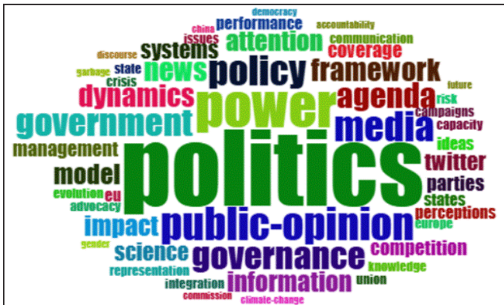
Figure 2 – Word cloud (1992-2020)