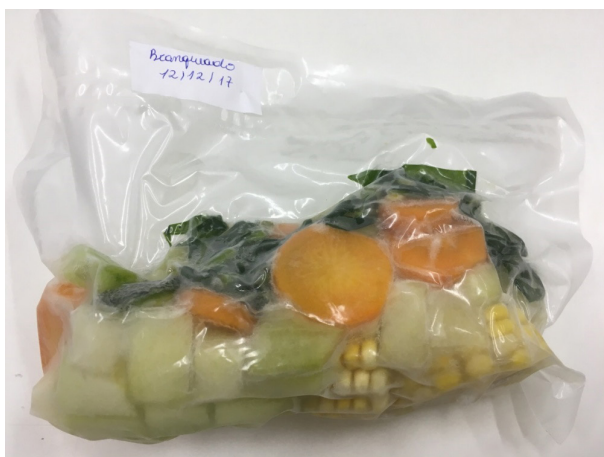
Figure 1: Organic vegetable kit provided by the Cooperativa Central da Agricultura Familiar Ltda (UNICOOPER), Santa Rosa - RS, produced in 2018.

For analyses, a blanched and unblanched vegetable kit were removed from the freezer each month, unpacked, shredded with the aid of a mixer, homogenized, and placed in plastic containers.