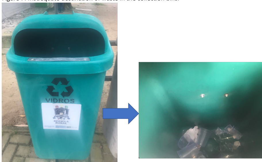
Figure 7: Inadequate destination of waste in the collection bins.

Another great institutional problem are the trash bins spread throughout the campus. Outside the UR there is a set of collection bins for several types of waste but with an inadequate allocation for each type of bin as shown by figure 7.