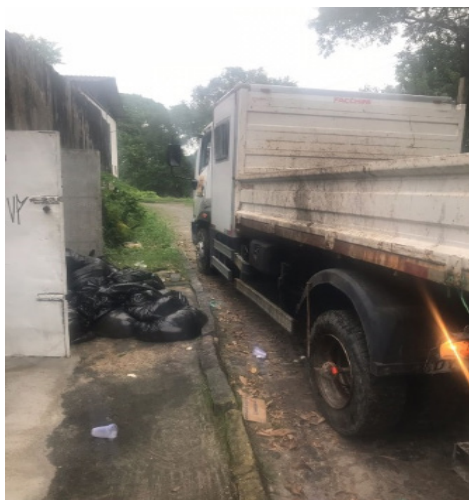
Figure 3: Disposal and collection of organic waste generated at the UR's lunch.

The other organic waste is separated within the UR and put in a trash deposit, open and exposed for collection by UFRPE's truck as seen in Figure 3 below.