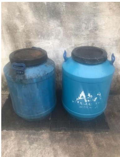
Figure 2: Plastic drums for kitchen oil collection at the UR.

Kitchen oil is stored in plastic drums and collected by the company Asa Industry and Commerce as seen in Figure 2 below.