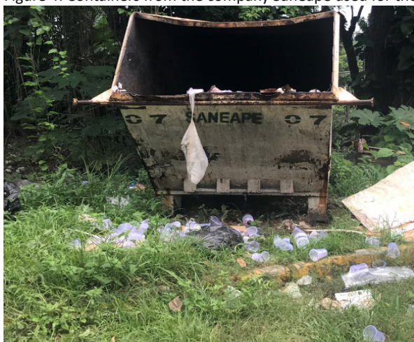
Figure 4: Containers from the company Saneape used for the gathering of the garbage generated by the UR.

Therefore, there are not any specific trash bins for each type of waste as Figure 4 verifies. It is also possible to see organic and inorganic waste in containers used for common trash.