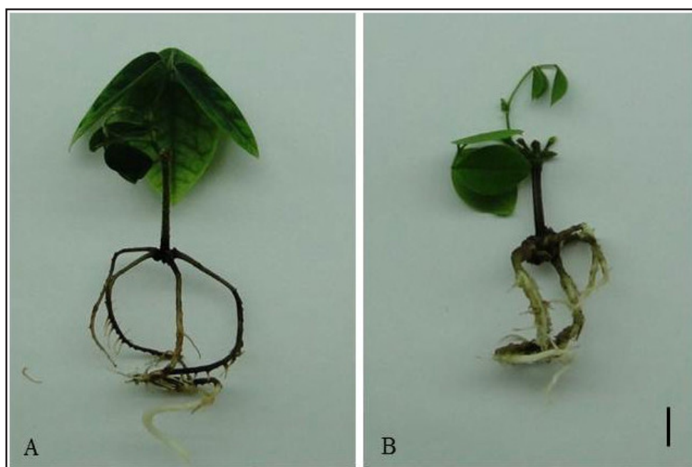
Figura 2 – Plantas de Apuleia leiocarpa produzidas pelo enraizamento in vitro em meio de cultura WPM sem auxina (A) e suplementado com 2,5 mg L -1 de ANA (B) aos 60 dias de cultivo. Barra = 1 cm