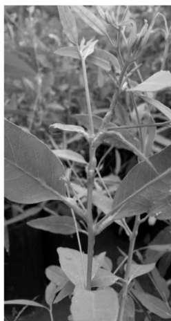
FIGURE 1: Eucalyptus grandis seedlings infested by Leptocybe invasa (Hymenoptera: Eulophidae) in Treze de Maio municipality, Santa Catarina state, Brazil.

The blue gum chalcid was recorded on Eucalyptus grandis seedlings in Treze de Maio, Santa Catarina state, Brazil. Eucalyptus grandis seedlings in full sun were more infested by L. invasa than those predominantly in the shade. Galls induced by the pest occurred mostly on the central leaf veins, the petioles and the green stems of these plants (Figure 1). Approximately 10% of nursery seedlings were infested and subsequently eliminated. The rest of the seedlings were treated with chemicals registered for this pest in Brazil.