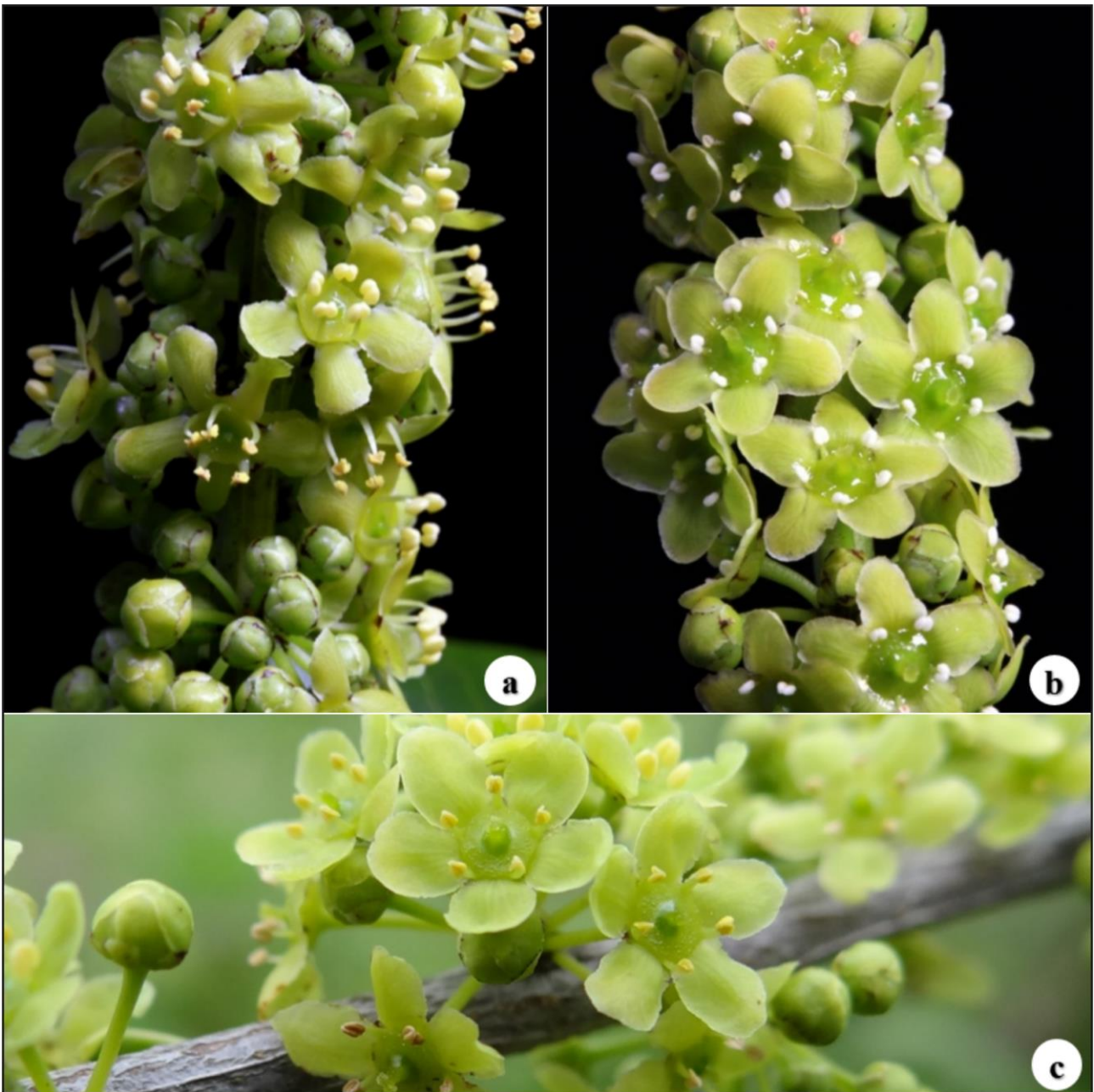
Figure 2 – Floral types of Monteverdia ilicifolia (Celastraceae), Pelotas, RS, Brazil - a. functionally male flowers; b. functionally female flowers; c. hermaphrodite flowers.

The anthesis of functionally male and functionally female flowers is diurnal. In 80% of the flowers, the anthesis starts at 6 pm on one day and it is completed at