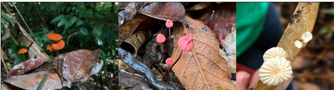
Figure 4 – Identification of specimens from the Marasmiaceae family collected at the T. Pimenta Jungle Base T. Pimenta