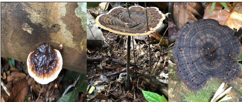
Figure 3 – Species of the Ganodermataceae family collected at the T. Pimenta Jungle Base