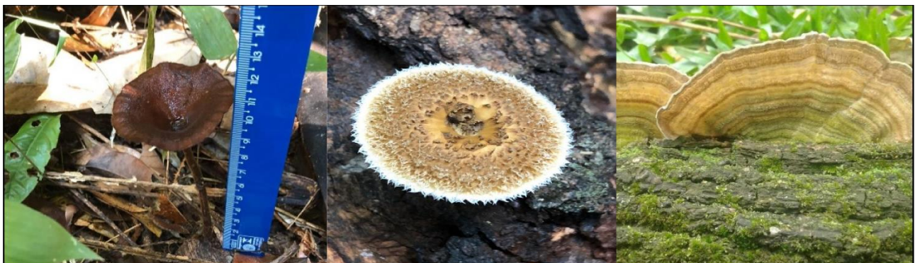
Figure 5 – Specimens of the Polyporaceae family collected at the Base of Selva T. Pimenta