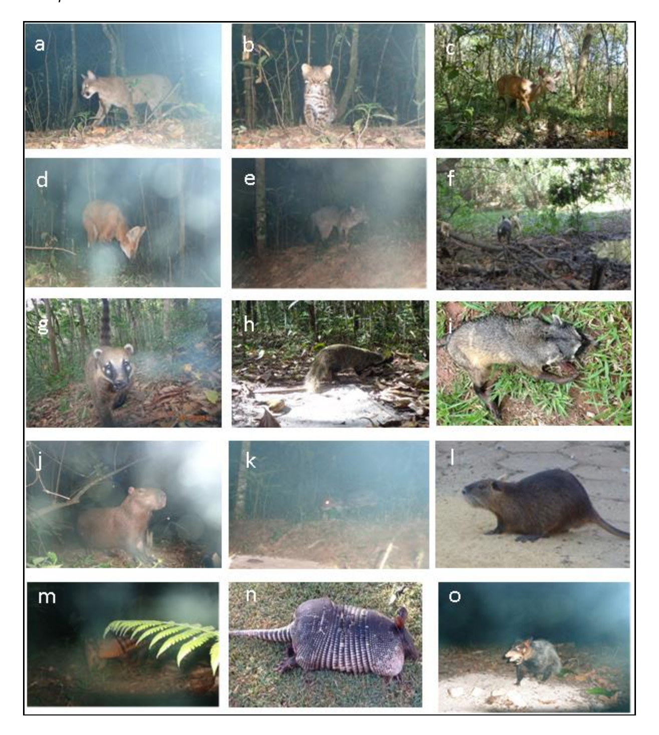
Figure 2 - Medium- and large-sized mammals recorded in Inconfidentes Campus/Minas Gerais state; a: Puma concolor ; b: Leopardus tigrinus ; c: Ozotoceros bezoarticus ; d: Chrysocyon brachyurus ; e: Cerdocyon thous ; f: Canis familiaris ; g: Nasua nasua ; h: Galictis spp. ; i: Procyon cancrivorous ; j: Hydrochoerus hydrochaeris ; k: Agouti paca ; l: Myocastor coypus ; m: Euphractus sexcinctus ; n: Dasypus novemcinctus ; o: Didelphis aurita .

Ribeiro et al. (2009) verified that 83.4% of the Atlantic Forest fragments are within the size class ranging from 0 to 50 ha, thus validating the importance of surveying these reduced fragments for the development of conservation strategies at local and regional level. Despite the reduced area of the forest fragment under