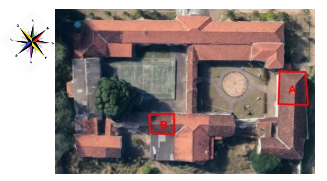
Figure 1 - Location of classrooms A and B in Educandário

The school under study was founded in 1931 and was initially an orphanage intended to house the children of leprosy patients in the Anil district of São Luís (MA). It currently functions as a day care center/school, serving 60 children aged between 6 and 10 years, with 4 rooms in operation. Structurally, the school has the architectural features of an old farmhouse, with unlined rooms, half walls, red ceramic floors, and walls painted with green and light pink stripes. It still has a ceramic tile roof. The building is segmented into one administrative block and two classroom blocks, one of which features a dining room, kitchen, outdoor court, and patio (see Figure 1). It should be noted that the façades of the greater extension used in the analysis of the solar incidence are oriented towards the northeast and southwest in the case of room A, and northwest and southeast for room B. In Figure 1, the locations of the classrooms used in the study are marked as rooms A and B.