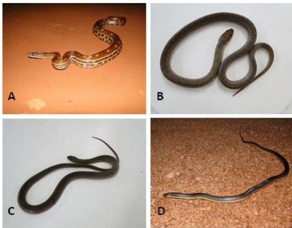
Figure 2: Representatives of snake species found during the field study: A) Epicrates cenchria ; B) Erythrolamprus poecilogirus ; C) Erythrolamprus reginae ; D) Phimophis guerini ; to be continued....