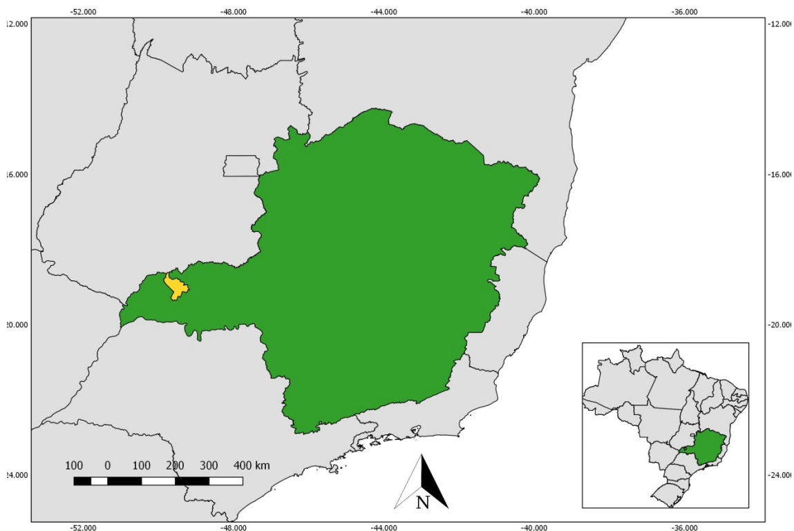
Figure 1 - Location of the Municipality of Ituiutaba (in yellow) in the state of Minas Gerais (in green), southeastern Brazil

The municipality of Ituiutaba is located in the “Pontal do Triângulo Mineiro”, in the west of the State of Minas Gerais, (49° 27' 54" W; 18° 58' 08" S, figure 1), with a total area of about 2600 km 2 . The local biome is characterized mainly by Cerrado phytophysionomies (IBGE, 2016). The climate is tropical with rainy summers and dry winters, where the average monthly temperature is about 18°C (TONIETTO, 2006), and an average annual rainfall of 1450 millimeters (QUEIROZ, 2012).