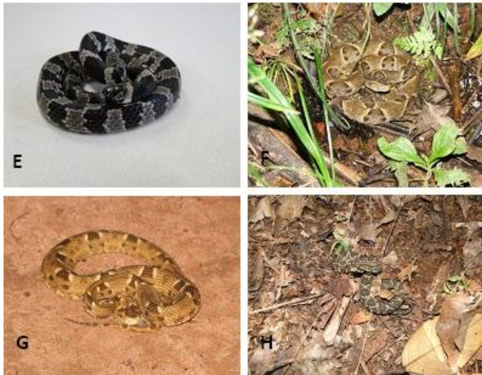
Figure 2: continuation...E) Sibynomorphus mikanii ; F) Bothrops moojeni ; G) Bothrops neuwiedi ; H) Crotalus durissus .

The Dipsadidae was the most diverse family, corresponding to 56.5% of the total richness and 55% of the total abundance. Considering all individuals analyzed, the most common species was Bothrops moojeni (n=10, 18.5%), followed by Sibynomorphus mikanii (n=8, 14.8%), and Oxyrhopus guibei (n=6, 11%). Four analyzed individuals could not be identified, three because of the poor state of conservation and roadkill in one case.