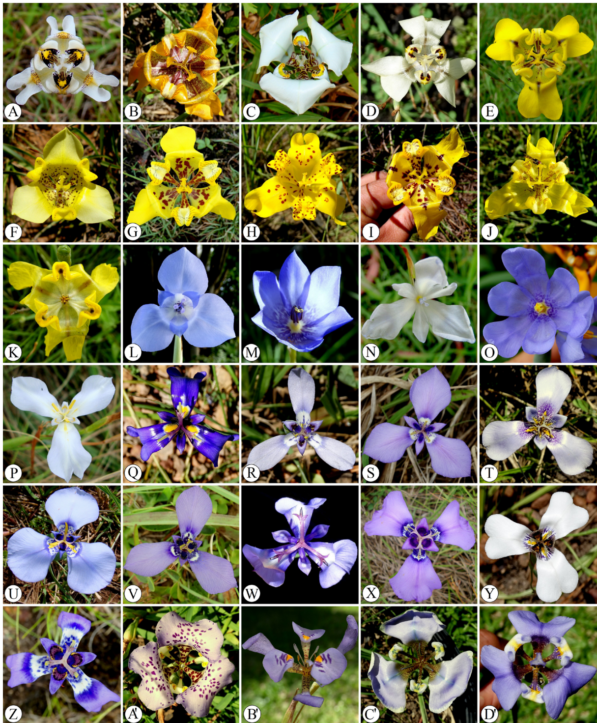
Figure 2. Diversity of Iridaceae-Tigridiaceae in the SESA grasslands. A. Cypella luteogibbosa . B. Cypella magnicristata . C. Cypella opalina subsp. opalina . D. Cypella Osteniana . E. Cypella parviflora . F. Cypella pusilla . G. Cypella Ravenniana . H. Cypella rivularis . I. Cypella suffusa . J. Cypella trimontina . K. Cypella uliginosa . L. Gelasine caerulea . M. Gelasine elongata . N. Gelasine paranaensis . O. Gelasine uruguayensis subsp. uruguayensis . P. Herbertia amabilis . Q. Herbertia amatorum . R. Herbertia amoena . S. Herbertia caerulea . I. Herbertia Crosae . U. Herbertia Darwinii . V. Herbertia lahue . W. Herbertia pulchella . X. Herbertia quareimana . Y. Herbertia zebrina . Z. Herbertia sp. A'. Kelissa brasiliensis . B'. Larentia linearis . C' Onira unguiculata . D'. Phalocallis coelestis .