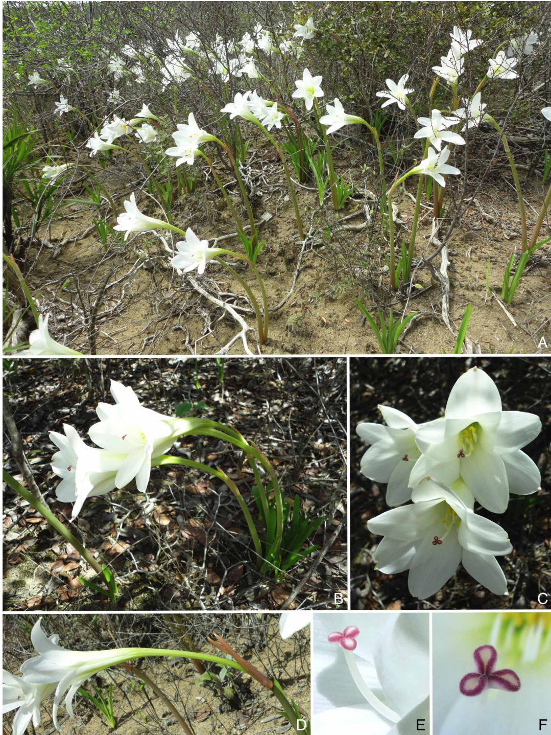
FIGURE 4 – Tocantinia stigmovittata Büneker, R. Bastian & C. Costa ( C. Costa 05 ). A – Population in habitat. B – Habit. C – Flowers viewed from above. D – Side view of the inflorescence. E – Side view of the stigma. F – Upper view of the stigma.