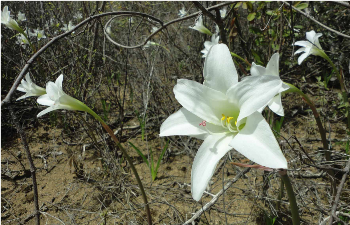
FIGURE 5 – Tocantinia stigmovittata Büneker, R. Bastian & C. Costa in habitat (C. Costa 05).

southwestern Bahia state (Brazil). Is also found growing in public gardens in the city of Caetité (Bahia), municipality that borders Lagoa Real.