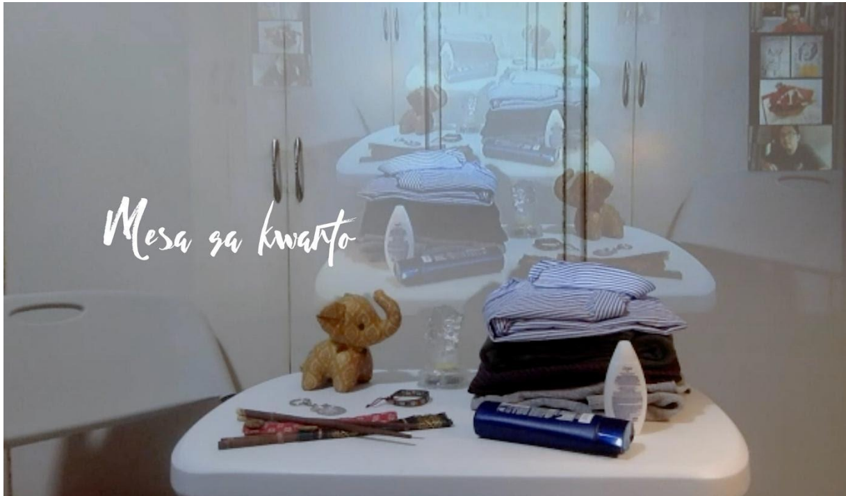
Figure 1 – Zoom gallery installation of Mesa Sa Kwarto

This paper was first presented in the Visual Culture Working Group of the International Association for Media and Communication Research (IAMCR) Conference 2021.